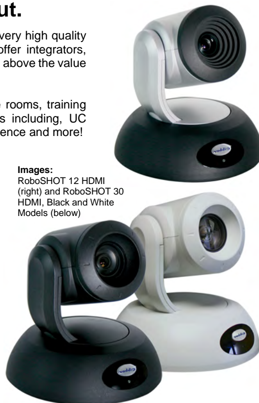
Images: RoboSHOT 12 HDMI (right) and RoboSHOT 30 HDMI, Black and White Models (below)