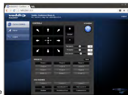
Image: Example of Built-in Camera Control Web Page

The RoboSHOT cameras were designed for the times and represent a new era in specifying and integrating professional quality cameras into A/V and conferencing system configurations. In short, it has never been easier to integrate cameras into any project than with the RoboSHOT HDMI cameras